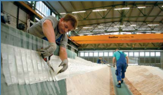
Production of GFRP/epoxy blade shells

Step-by-step introduction of automation in production processes largely dominated by manual labor. Together with the Bremen Institute for Construction Technology, we developed an automated preforming method (Preblade Project).