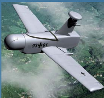
KZO, Rheinmetall Defence Electronics GmbH