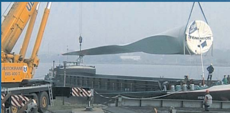
Loading of an E112 rotor blade at our ROTEC facility

Since 2000, we have been producing rotor blades using vacuum infusion. This method makes it possible to serially manufacture large-sized rotor blades with a consistently high laminate quality. In 2001, the company was commissioned by Enercon GmbH to build what at that time were to be the longest rotor blades in the world. Each blade weighed 20 tons and permitted the construction of rotors with a total diameter of 112 m (367 ft). The rotor blades were transported by ship and have been in successful service ever since.