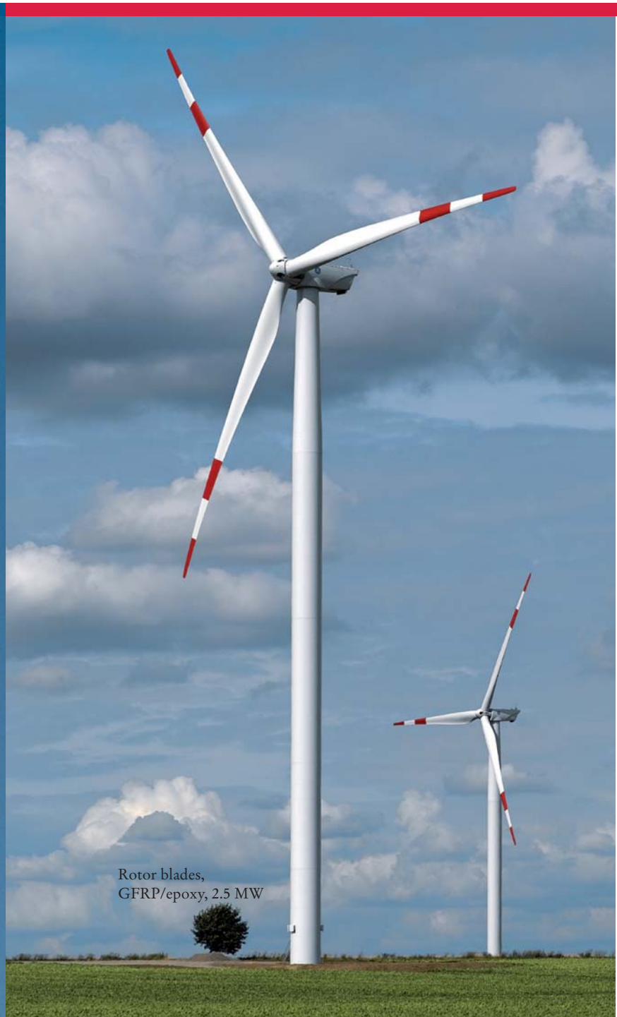
Rotor blades, GFRP/epoxy, 2.5 MW