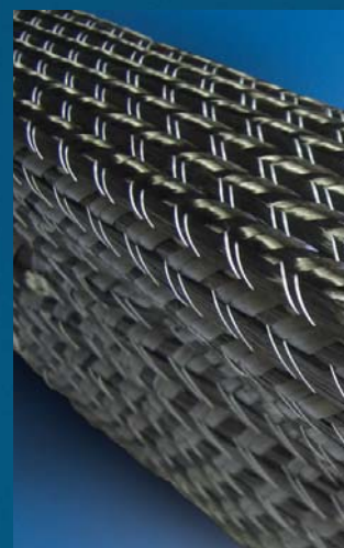
Braidings and preforms