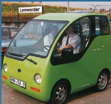
“SAX” electric vehicle, GFRP/epoxy sandwich