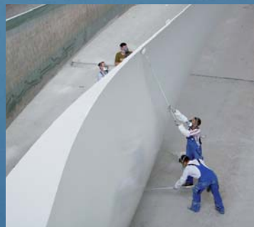
Application of a water-based polyurethane coating