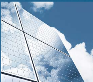
GFRP frames for solar cells in photovoltaic modules

Depending on customer requests, SGL Rotec also develops and manufactures individual composite components or small production series. One example is a glass fiber-reinforced body made from an integrated and crash-absorbing sandwich structure for use in electric vehicles or aviation drones consisting of glass- and carbon fibers.