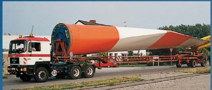
Rotor blade transport (Aeolus II, 40 m, 9 t, CFRP/GFRP/epoxy)

We have been manufacturing rotor blades since the 1980s using fiber composites. In the early 1990s we constructed carbon-/glass fiber composite rotor blades – the largest in the world at the time – which measured 40 m (130 ft) in length, weighed 9 tons and were designed for the Aeolus II wind turbine, a 3 MW two-blade plant.