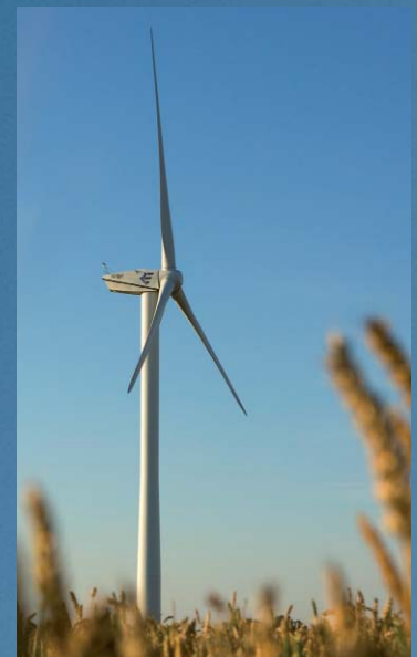
REpower MN 82, GFRP/epoxy

Since 2000, we have been producing rotor blades using vacuum infusion. This method makes it possible to serially manufacture large-sized rotor blades with a consistently high laminate quality. In 2001, the company was commissioned by Enercon GmbH to build what at that time were to be the longest rotor blades in the world. Each blade weighed 20 tons and permitted the construction of rotors with a total diameter of 112 m (367 ft). The rotor blades were transported by ship and have been in successful service ever since.