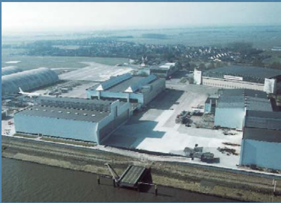
SGL Rotec, Lemwerder site

The facility is located on the banks of the River Weser with direct access to the port. This location on an international waterway permits direct shipment from the production plant, so that our company is ideally positioned to manufacture large rotor blades for offshore turbines. The site is also optimally connected to the national road network.